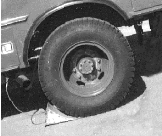
Vehicle heading down slope