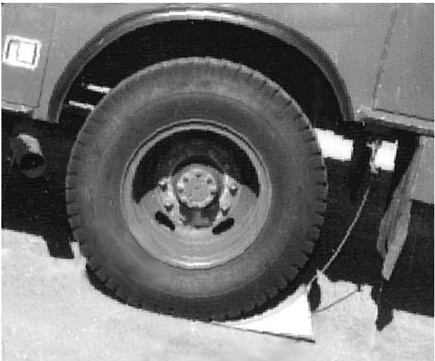
Vehicle heading up slope